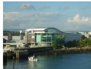
National Marine Aquarium