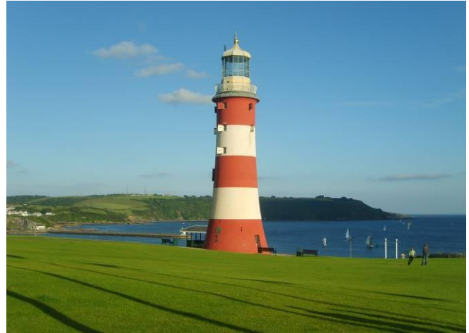
Smeaton's Tower, Plymouth Hoe

Smeaton's Tower is the iconic image of the City. This lighthouse was built 14 miles out to sea in 1759 and was moved to Plymouth Hoe in 1882 when the rock on which it stood started to crack and a new lighthouse had to be built on the Eddystone Rocks. Smeaton's Tower is open to visitors and affords dramatic views over Plymouth Sound.